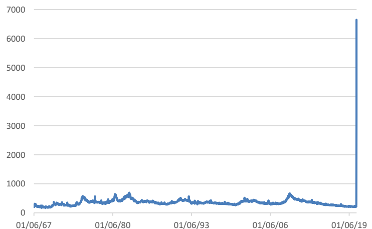
Weekly Unemployment Claims Reflect Public Health Response, Not Demand Weakness (Thousands)

Source: Appleton Partners, Inc. and St. Louis Fed