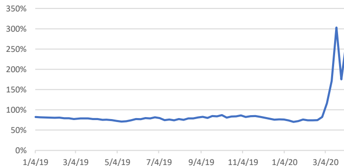
10 Year Muni/Treasury Ratio